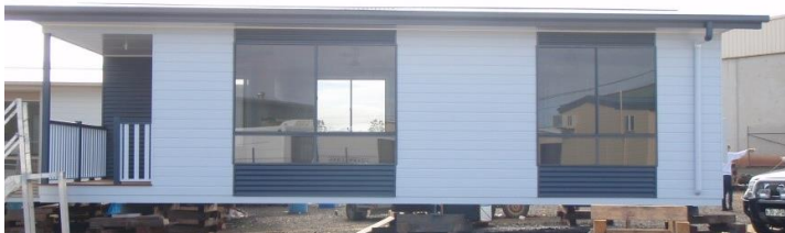
Illustrations are for guidance only.

All designs can be modified to suit your needs.