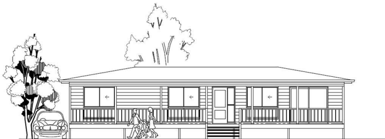
Illustrations are for guidance only.