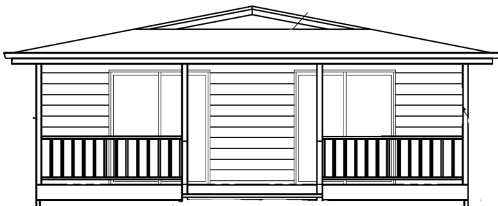
Illustrations are for guidance only.