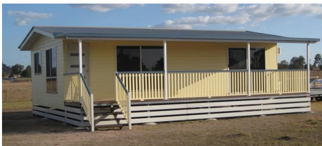
Illustrations are for guidance only.